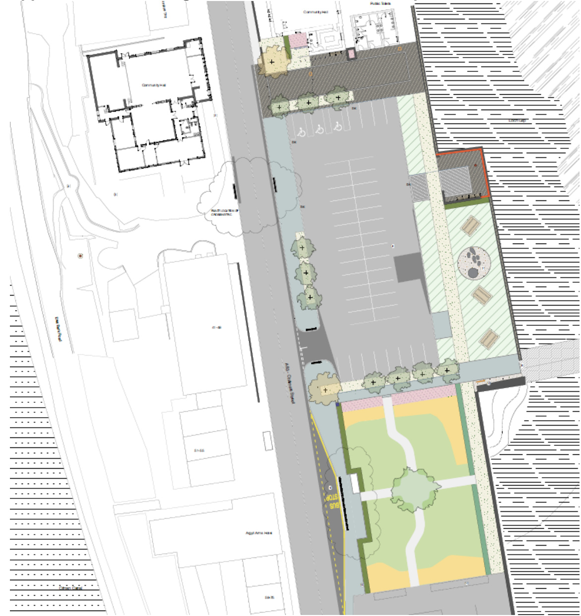
Appendix 2 – Ardrishaig North Public Realm Landscape Plan